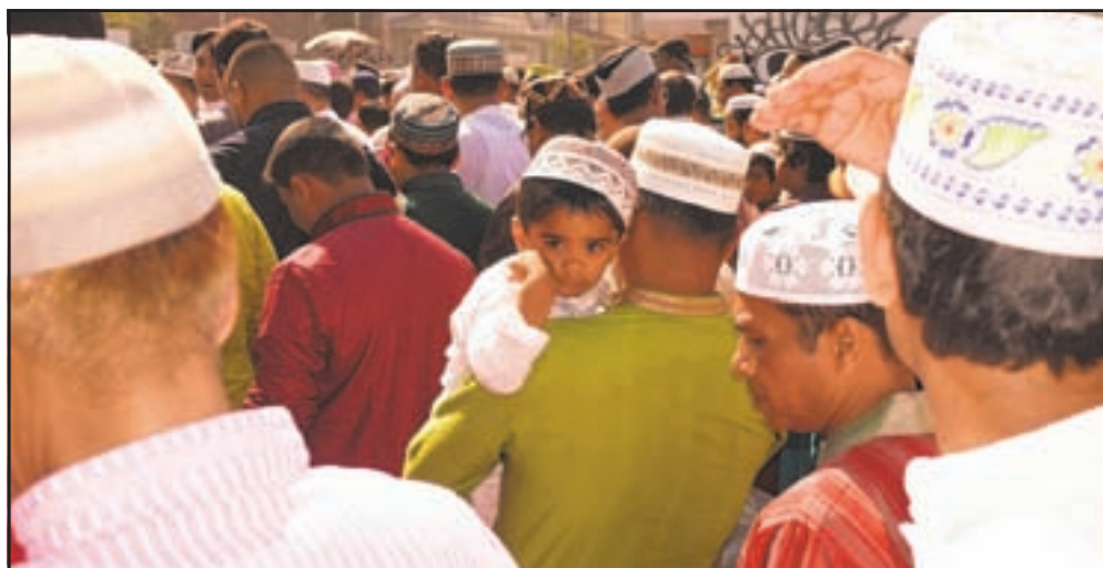
The end of the holy month of Ramadan is marked by a holiday called Eid ul-Fitr, when the fasting is over. Children are welcome to come along as observant Muslims head to the Jamaica Muslim Center for services.