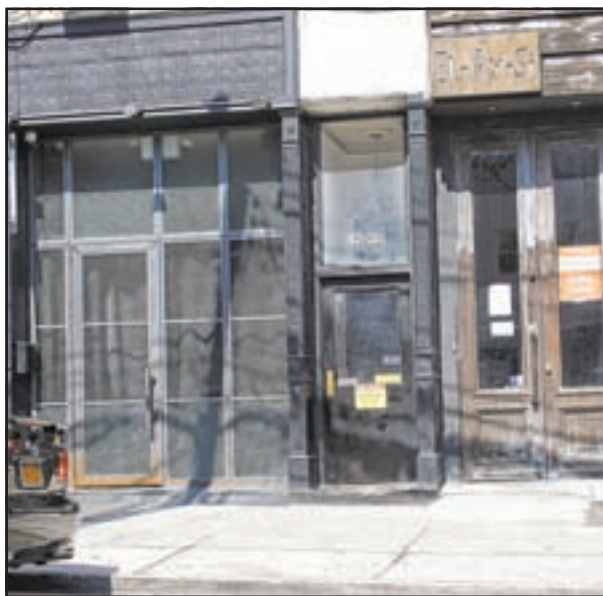
The Standing Room does not have a sign yet, but it has been open since June with comedy stand-up and musical performances.

In addition to stand-up comedy and live musical performances, The Standing Room offers specialty cocktails and microbrew beer. The ownership group behind the club is the same team that opened The Stand in Manhattan, which was named Best Comedy Club