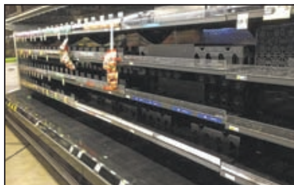
The shelves of the A&P-owned Waldbaum supermarket in Bayside Terrace are stripped bare on the day the chain filed for bankruptcy.