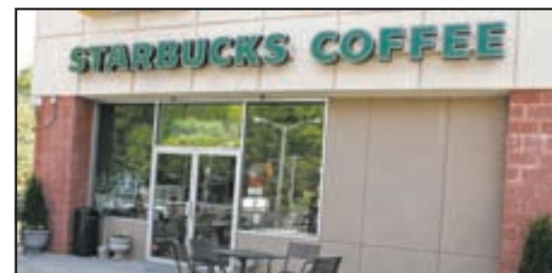
This Starbucks in the Atlas Mall is closed now but the high-end coffee place is set to open its first shop in Jamaica.

The community's high unemployment rate was one of the determining factors for Starbucks' decision to open in Jamaica.