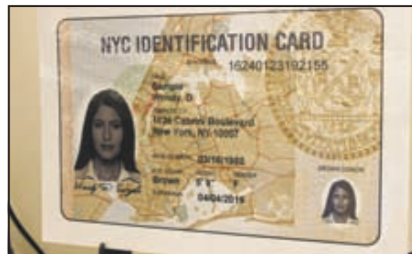
The city unveiled a special municipal ID card for veterans.

But he repeated calls for a veterans resource center, noting that $500,000 had