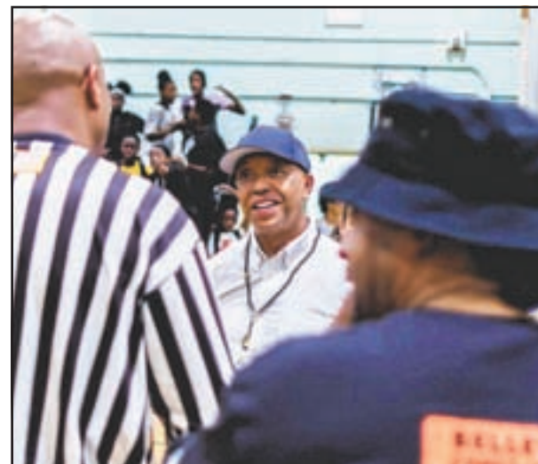
Hip-hop magnate Russell Simmons came back to South Jamaica for the annual Rush Card's Keep The Peace initiative to talk about meditation and being at peace.

Simmons, a practitioner of jivamukti yoga for almost two decades, asked campers to quiet down, close their eyes and meditate for several minutes while repeating a mantra in the silent