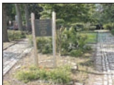
One of the smallest parks in the borough is about to get a $400,000 makeover.