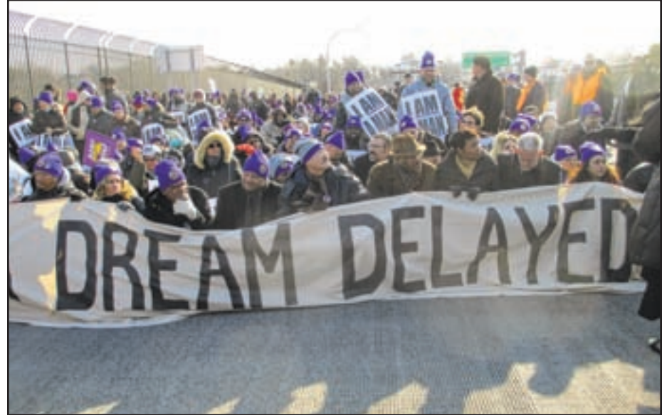
Three years of marches, protests, rallies and strikes by airport workers have them on the verge of joining a union.